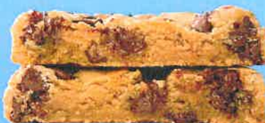
Gluten/Dairy Friendly Chocolate Chip