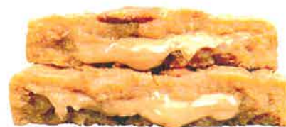
Ultimate Peanut Butter