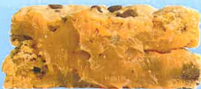
Salted Caramel Chocolate Chip