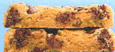
Original Chocolate Chip