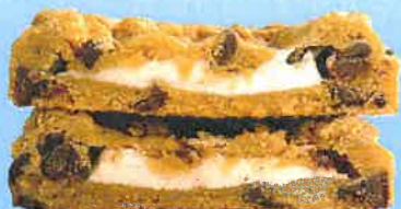
S'mores Stuffed Chocolate Chip