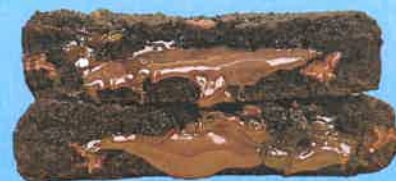
Gluten/Dairy Friendly Big Beautiful Chocolate

We do not encourage door to door, or selling to people you do not know. You can reach your goal by selling to trusted neighbors and friends!